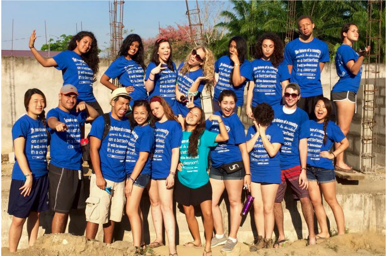
Students Helping Honduras on their Spring 2015 trip.

students who attended the trips continue to fundraise once back in the States. SHH's key philosophy is sustaining projects, not just building them. The organization is responsible for supporting the orphans it has adopted and placed in the home. By continually emphasizing the long-term effects of their projects and the importance of maintaining and building upon them year after year, SHH leaders keep their members active and dedicated to the cause.