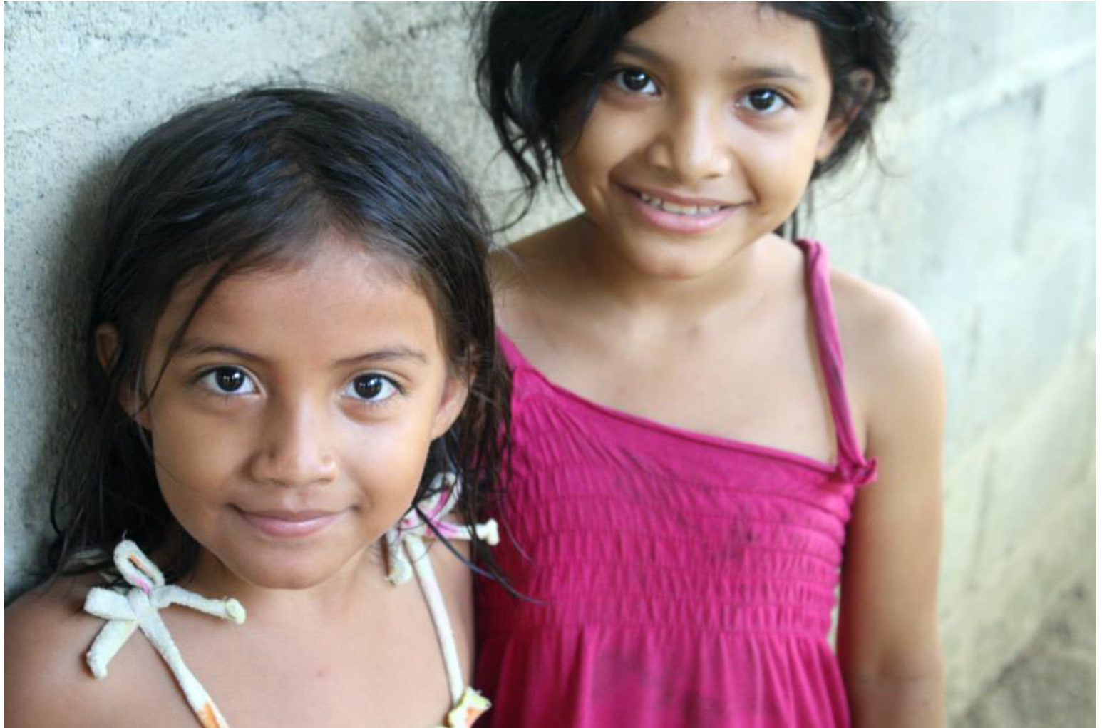
Honduran children at school.