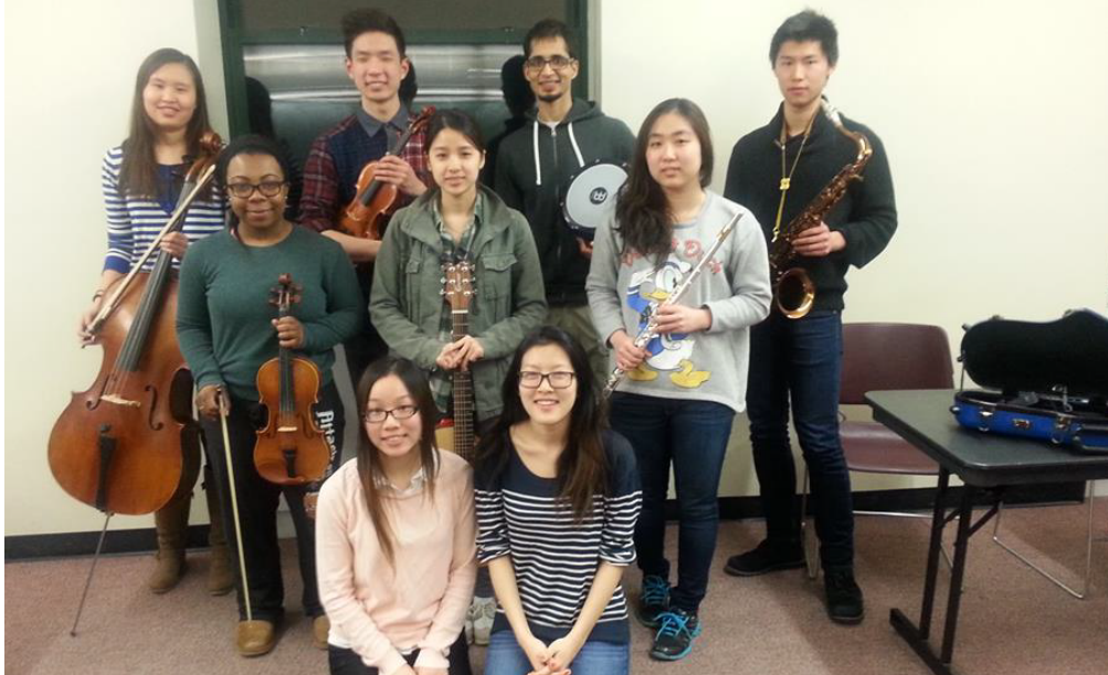
M&M performance at the SB Hospital Lobby.

told us after our performance, patients with Alzheimer’s may forget how to dress and eat, but they’ll never forget music.”