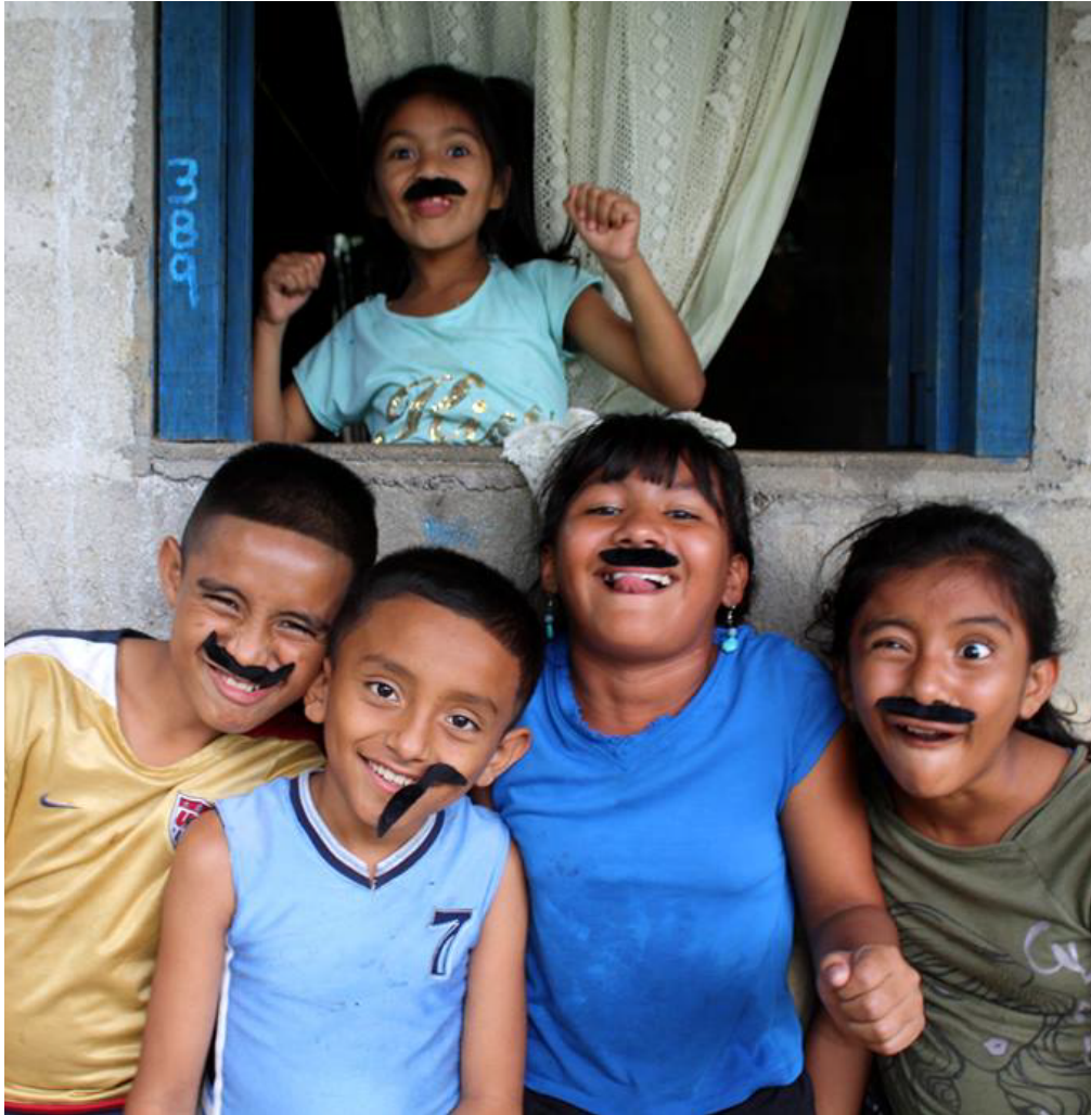
Honduran children at school.

tion has entirely changed my life. I've been extremely fortunate to become part of such a powerful group of individuals. We have become a movement, and I now have friends all throughout the United States." Being part of SHH has transformed her leadership skills and given her insight into what she wants to do after graduation. "My entire life revolves around this group, and around the kids, and I'm the happiest I've ever been."