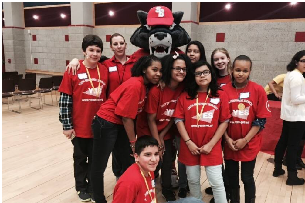
Students with Wolfie.