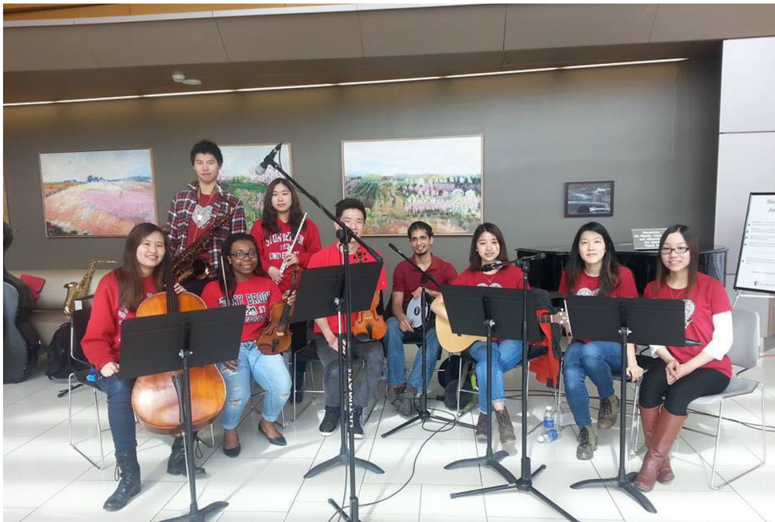
SBU Hospital Music Interlude Performance.